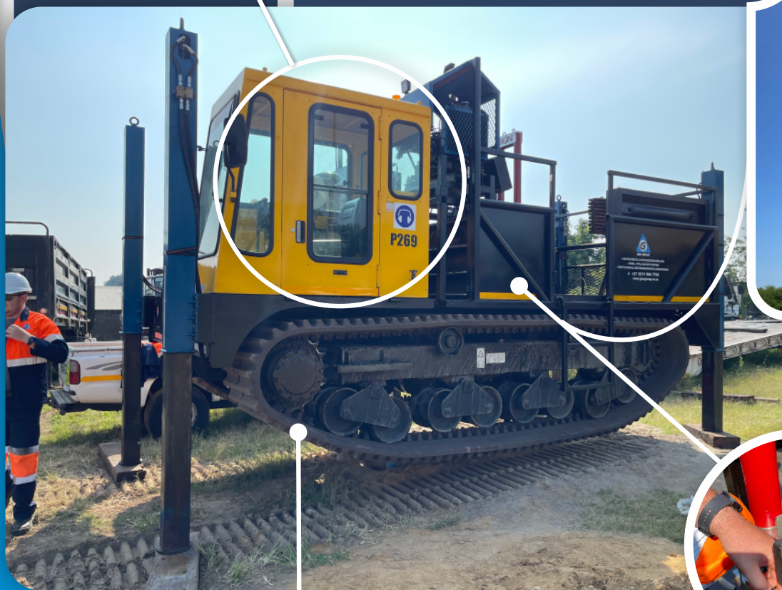
CPTu mast powered by Kubota water cooled engine with Salami hydraulics